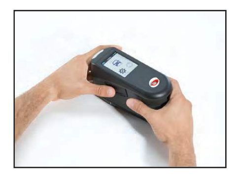
The device is easy to position on areas that are usually difficult to measure.