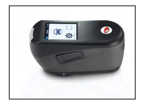
The sleek, compact design of the TOPAZ is small and easy to use.