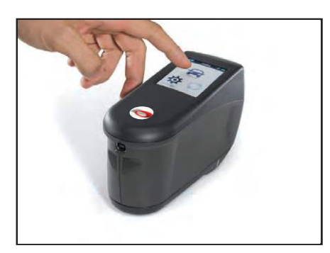
The Graphical User Interface is visually simple, easy to use, and touch screen operated.